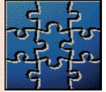
MUG Puzzle 2010-1